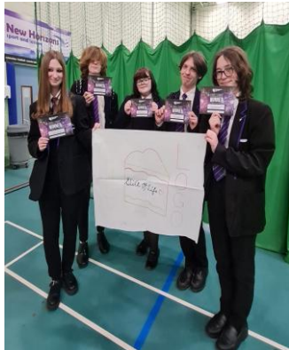
Girls Football Success continues