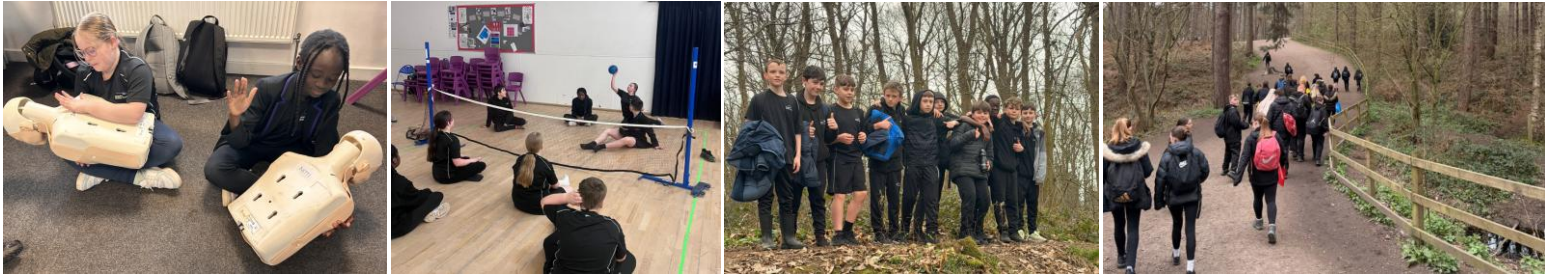
PE Barcelona Sports Tour