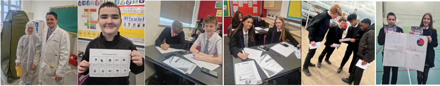
PD Day 2 Highlights