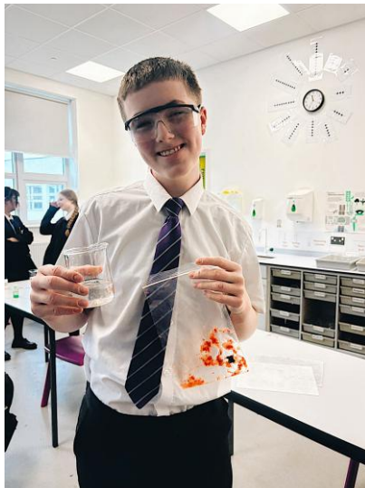
Y10 Science Lessons - DNA Samples