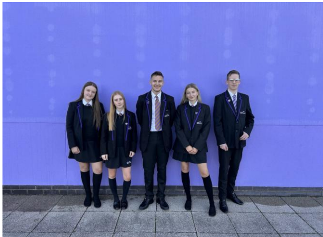
Y11 Senior Student Leadership Team