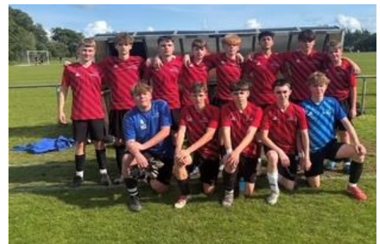
Safeguarding contact information:

DSL: Jadams@horizonoat.co.uk / ssheldon@horizonoat.co.uk