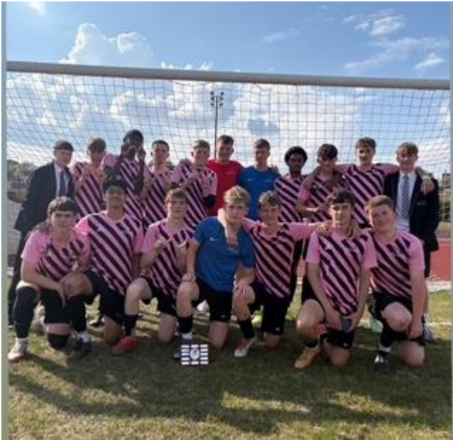
Y11 North City Final Football Success