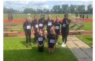
Y7 Athletics at Northwood