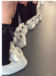
Alternative Footwear Day raised over £300!