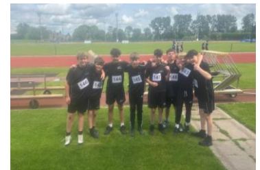
Y9/YO Athletics at Northwood