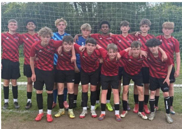
North Stoke Champions!