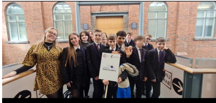
Year 8 and Year 9 Student Voice