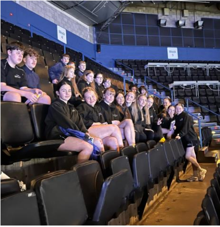
OATs Got Talent Finals