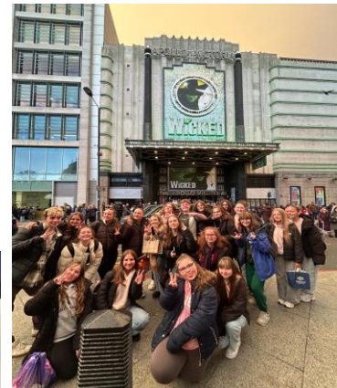
London Show Trip