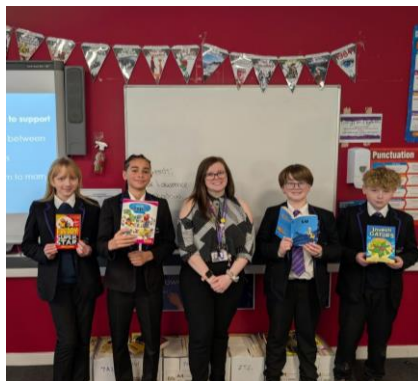
International Book Giving Day