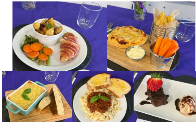
Year 11 GCSE Food Pieces