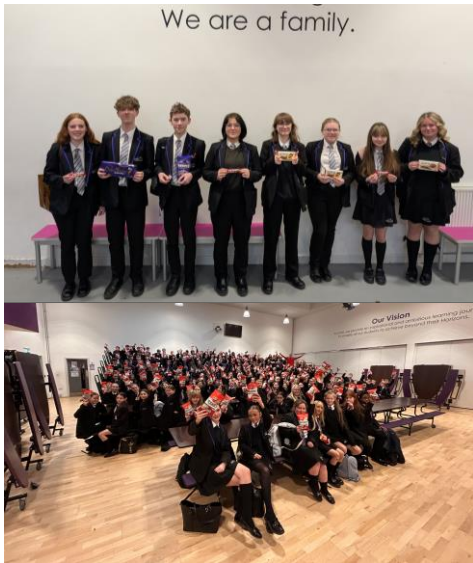
Rewards Bingo & Movie for HT 3