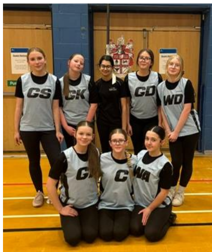
KS4 Netball Success Continues