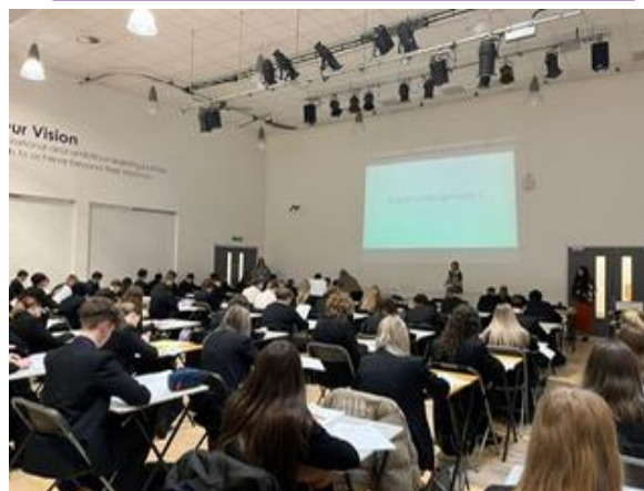
Y11 Walking Talking Mocks Begin