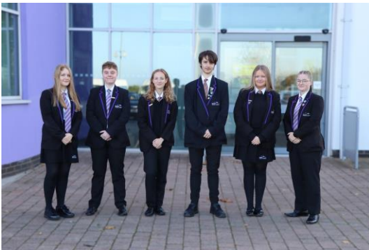
Y11 Leadership Team