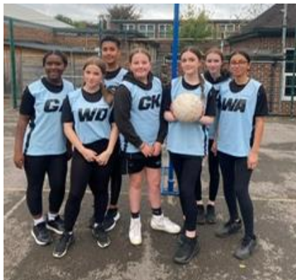
Netballers vs Endon