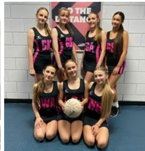
U15 City Champions!