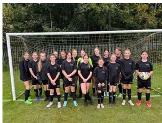
Girls Football Success continues...