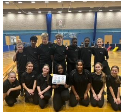
Y8 Partnership Games