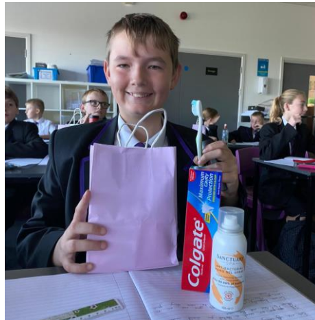
All Y7 received a complimentary toiletry bag during PSHE