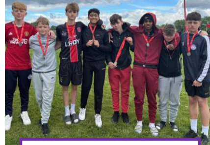
Man United Trip