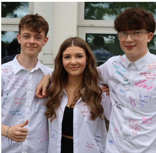
Y11 Leavers Assembly