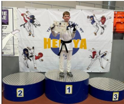
Sherratt Brothers Medals