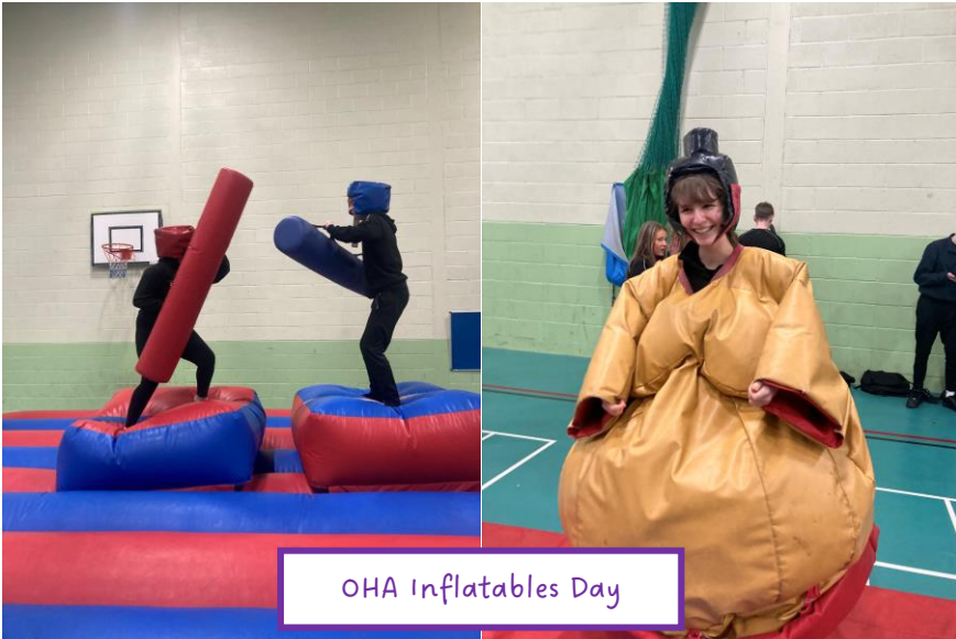
OHA Inflatables Day