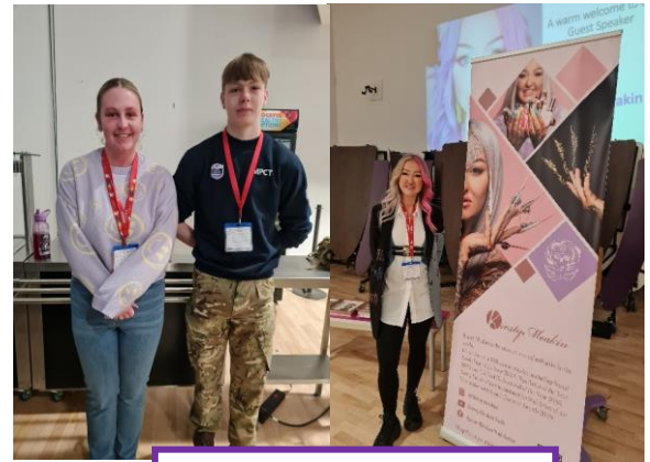
Careers - Guest Speakers and Alumni Students