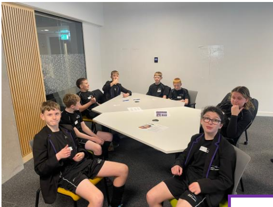
Football vs Homophobia