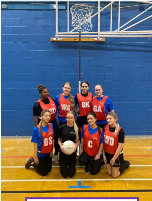
Y10 Netball City Team