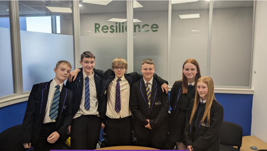
Y9 Industrial Cadet Graduates!