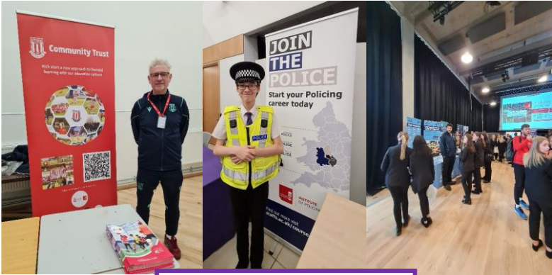
Careers Week Events