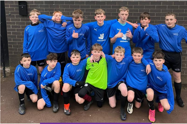
Y8 Football Team Success!