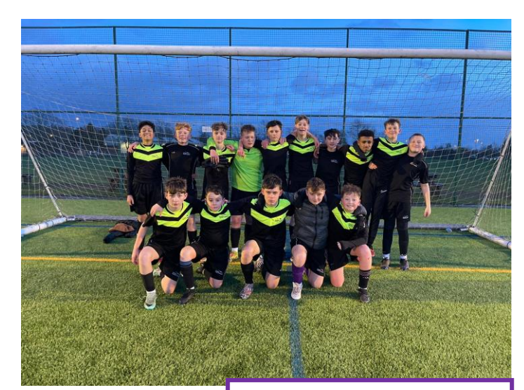
Y9 Boys Football, 14-3 win against St Peter's