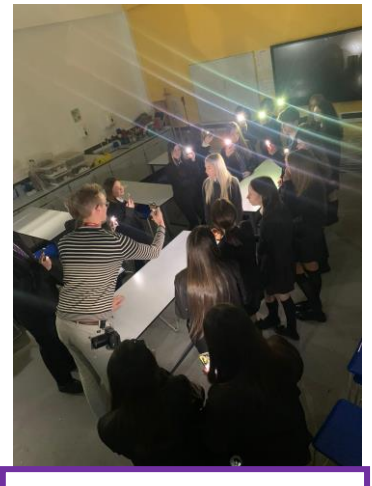
Year 10 Photography Workshops