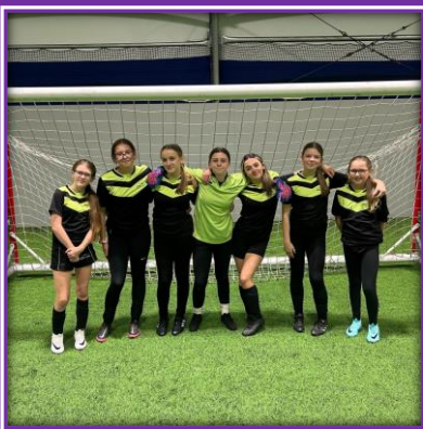
Y7 Footballers @ Stoke for the Rainbow Laces Campaign