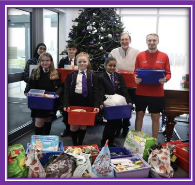
Chell Parish Pantry Donations 2023