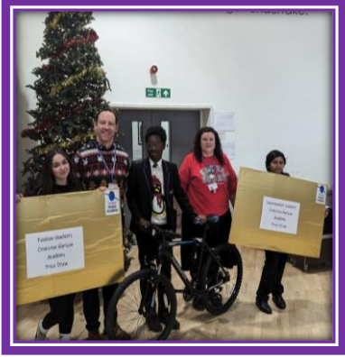
Attendance Winners 2023