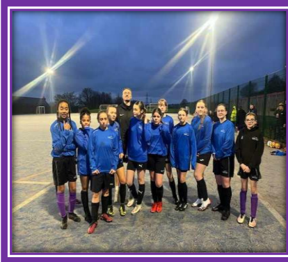
U16 Footballers winning their first fixture of 23-24.