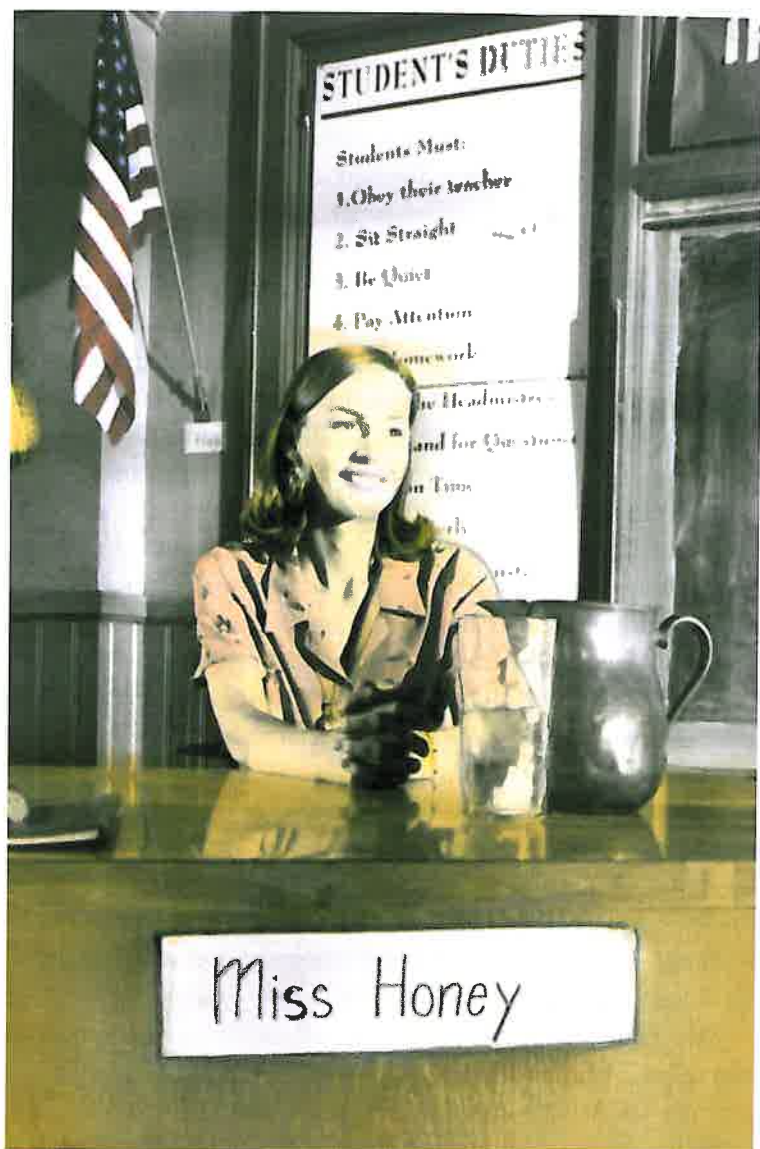
Their teacher was Miss Honey, and she was about twenty-three.