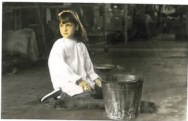
Mara Wilson as Matilda

Matilda starts school late. (Her parents forgot to send her.) Her teacher is Miss Honey, and she is the best teacher in the world. The head teacher is Miss Trunchbull. She is the worst teacher in the world and she hates children!