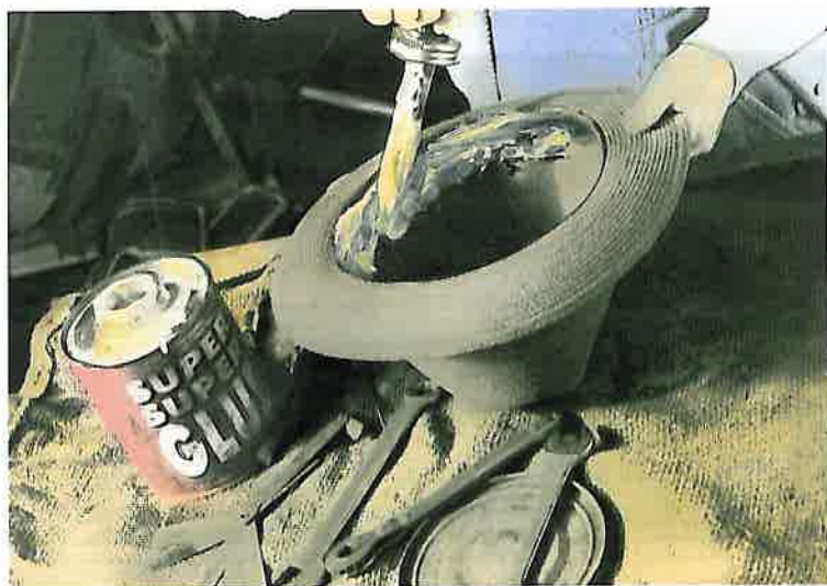
Matilda secretly took his hat and put a thin line of glue round the inside.

When he got home that evening his wife said, ‘Come here. I’ll take it off for you.’ And she pulled the hat hard.