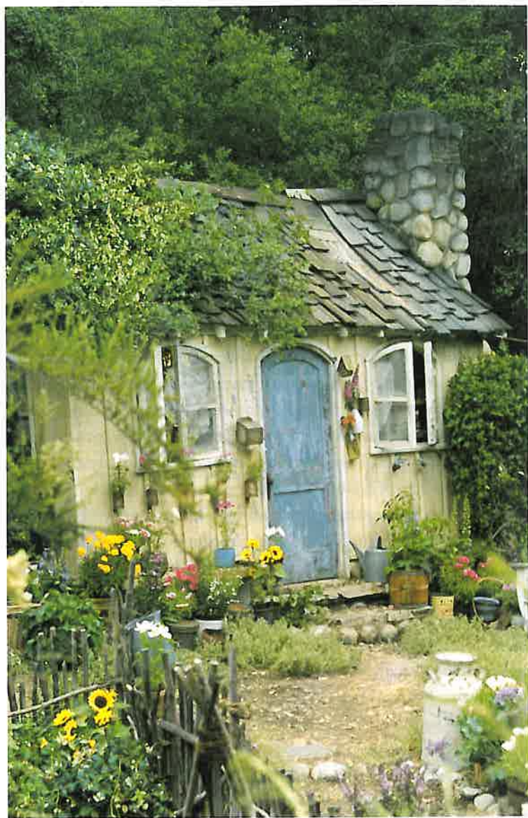
Suddenly, Matilda saw it between the trees.